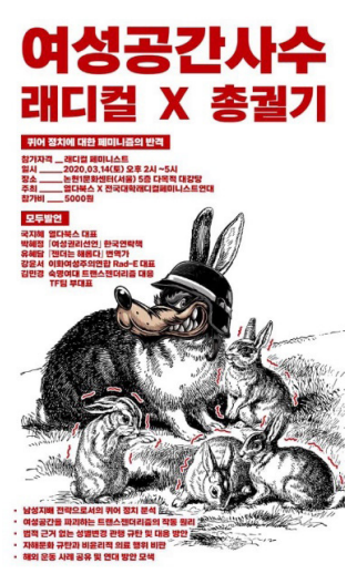
FIG. 3.—Poster of All-out for women's space shooter

In the above picture, we can observe a phobia, that is, a fear of abjects that could deconstruct these women's identity. In the framework of sexual dichotomy, transgender people, unlike men, are abjects who cannot be defined by the biological binary. Kristeva (1982, p. 4) explains that abjects are considered that which "disturbs identity, system, order," and that which "does not respect borders, positions, rules." Since TERFs presuppose the existing concept of the female identity as being based on biological dichotomy, they respond to their phobia of transgender women by defining them as biological males. They have been trying to understand transgender people as one of two in order to overcome their own fear of disintegration.