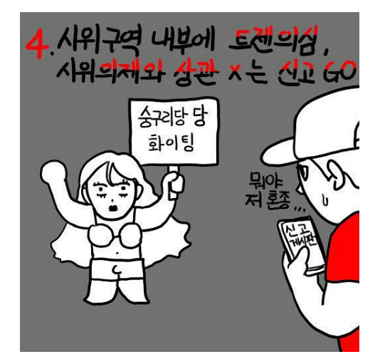
Fig. 2.—A picket at the demonstration "suspected [of being] transgender."